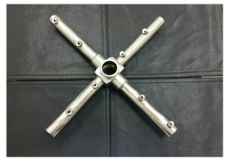
Spray Arm for ASQ, #081-6215 (cross arm) at 11.5" long (8 jets)