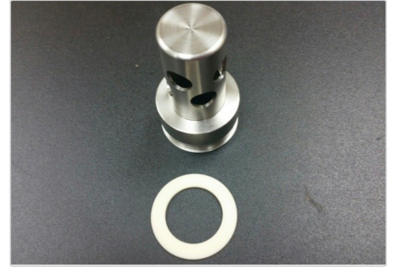
ASQ Spray Arm Pivot #084-6210 and Bushing Washer #098-2920