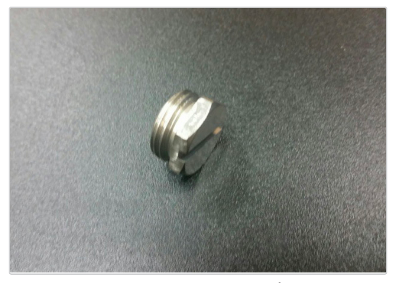
End cap #084-6211 thread size is 11/16-16 threads per inch, 11/16" wench, right-hand thread