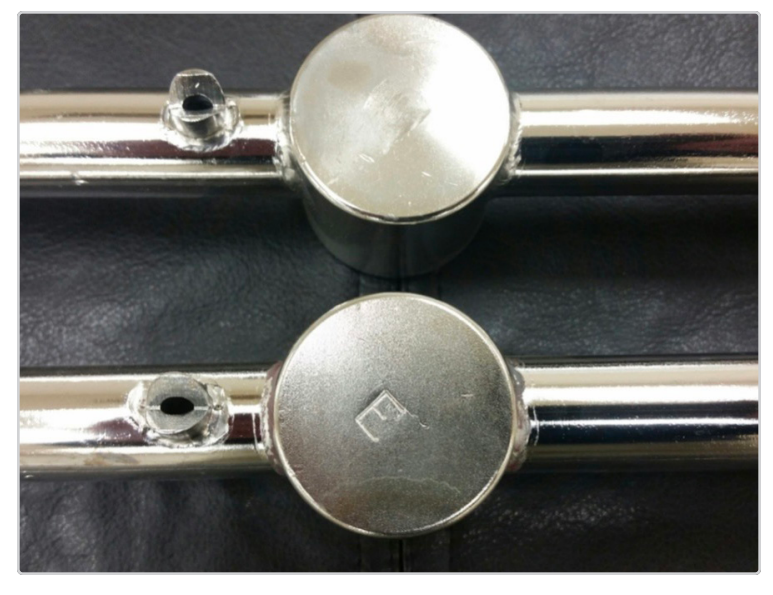
"E" stamp on Energy Star Spray Arm Hub