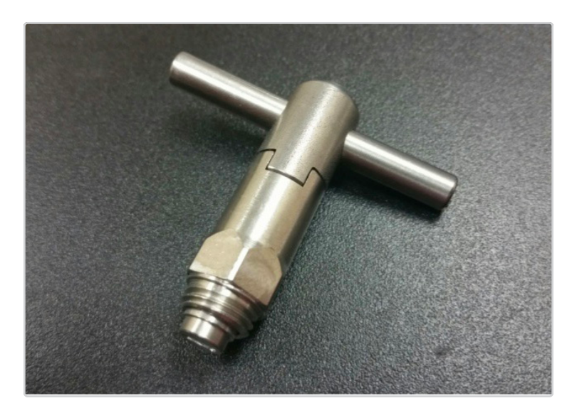
Spray Base Bayonet #099-1028