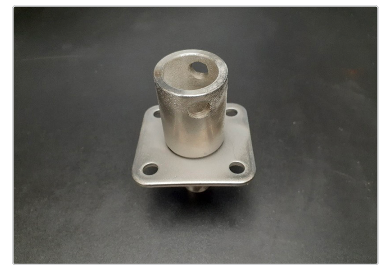
ASQ II Spray Arm Base #085-6645 for Spray Arm Bearing #081-6206