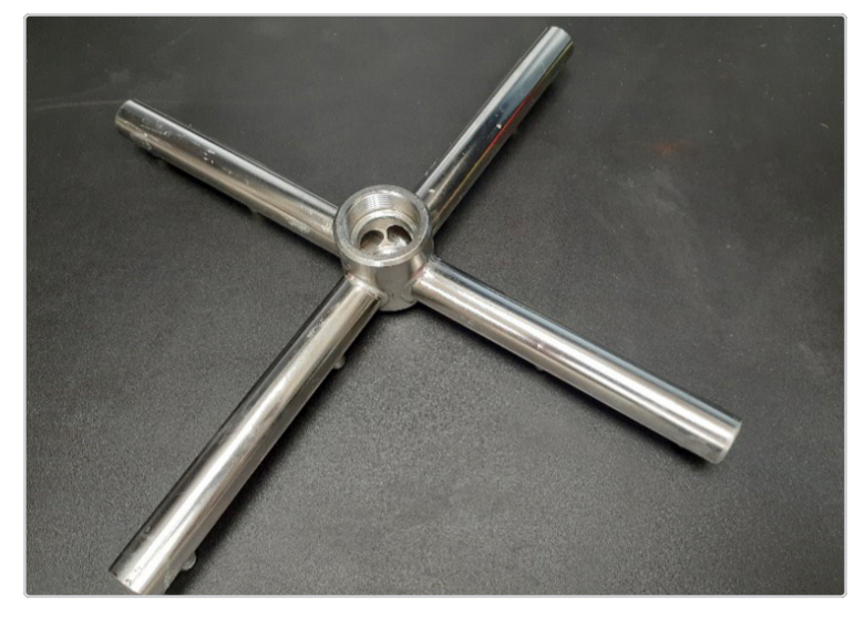
Spray Arm for ASQ II, #085-6662 (cross arm) 11.5" long (8 jets)